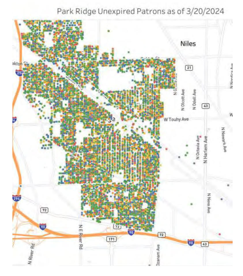
At this point, we do not have cardholder by household data for our peer libraries, but will plan to run this report annually going forward to track our progress in getting library cards into more households. I would recommend that when we do our next round of strategic planning, we incorporate a metric/goal (for example: 75% of households in Park Ridge will have at least one library card by 2028) for increasing cardholders.