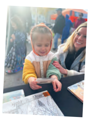
Library staff were around town at the Farmer's Market, National Night Out and Back to School Nights at local schools.